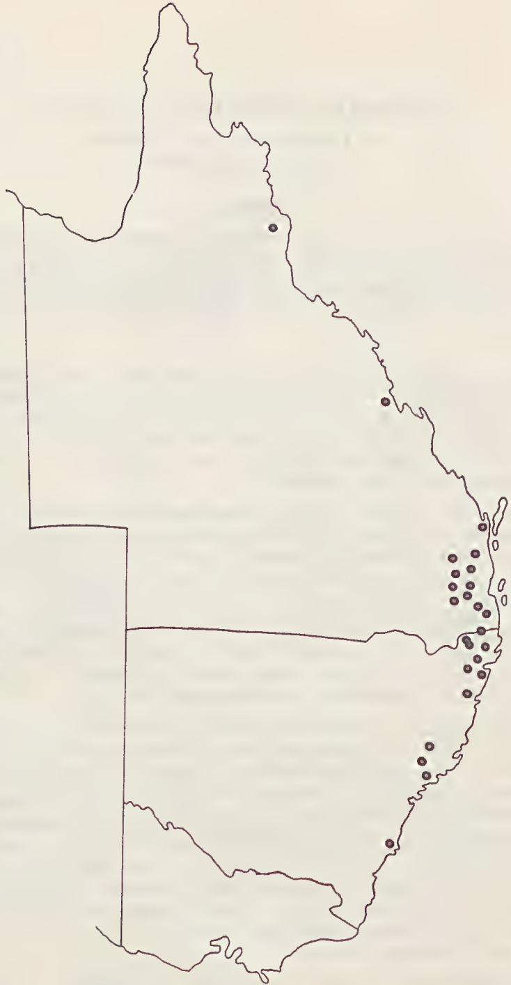
Fig. 1. Map of Eastern Australia showing distribution of Celastrus subspicatus . Note that this species occurs also in New Caledonia and New Guinea (see text).